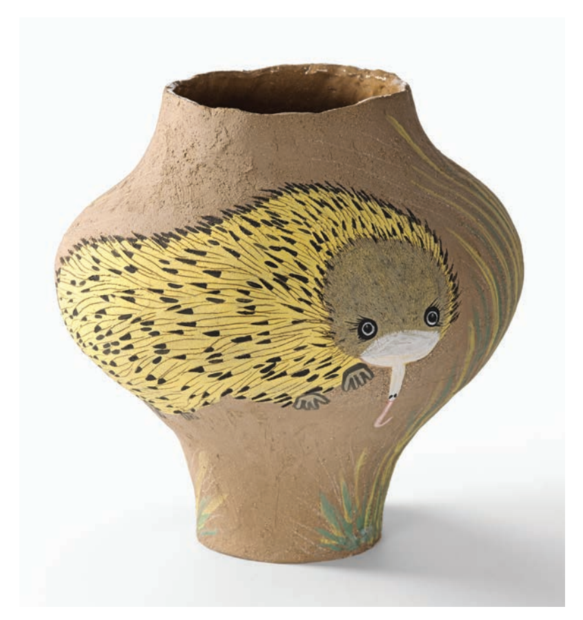
Daisybell Nungala Virgin, Echidna 2011 dark hand building clay, 38 x 37 cm courtesy of the artist and Jam Factory Contemporary Craft and Design, Adelaide photograph: Matthew Stanton © the artist