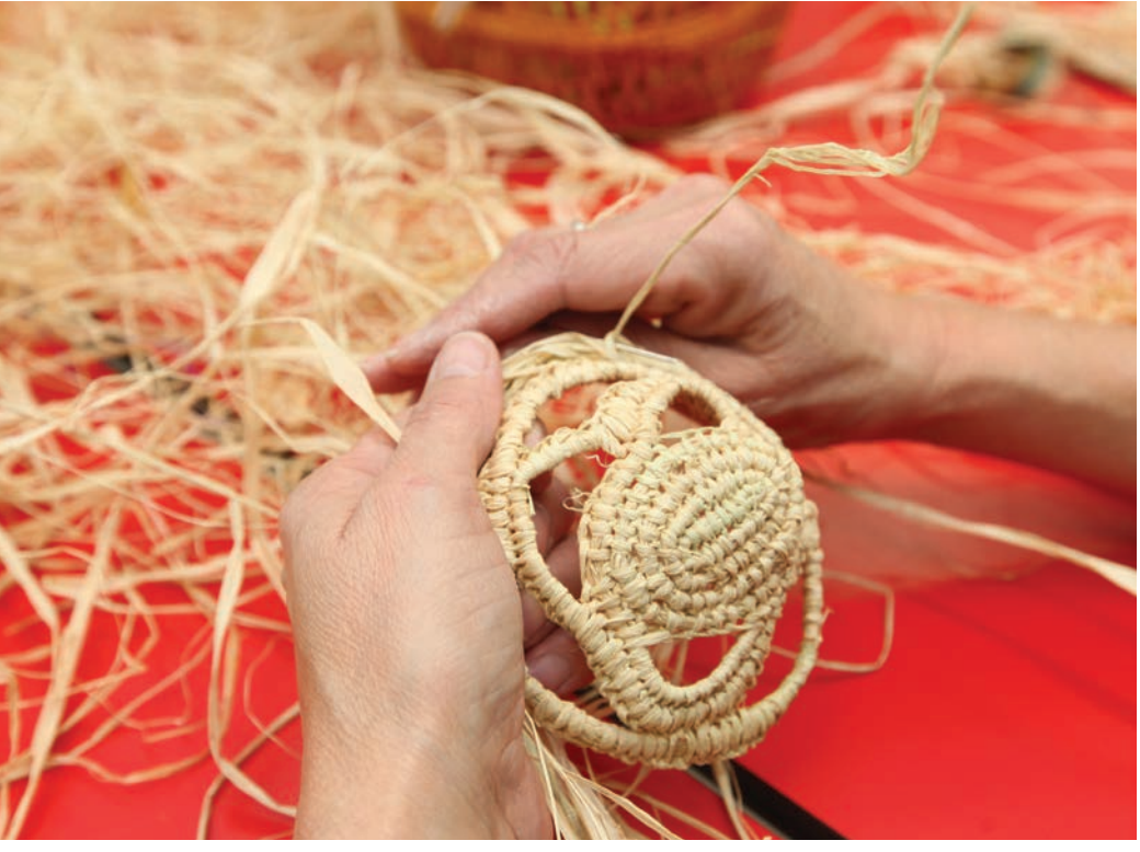
SAM's eight-week cross-cultural weaving program for women will run every Wednesday from 7 May to 25 June at Gallery Kaiela, Shepparton.

Gallery Kaiela extends an open invitation to visit the artists at work in the newly established studio space. Artists will speak informally about the ceramic works they have produced as a result of a partnership with SAM and the ICAA.